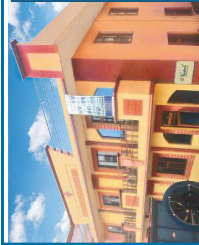
OUR MANUFACTURING FACILITY