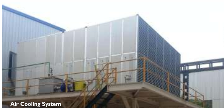
Air Cooling System