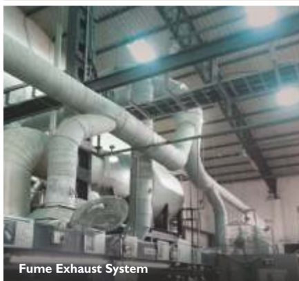
Fume Exhaust System