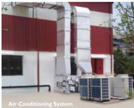
Air Conditioning System