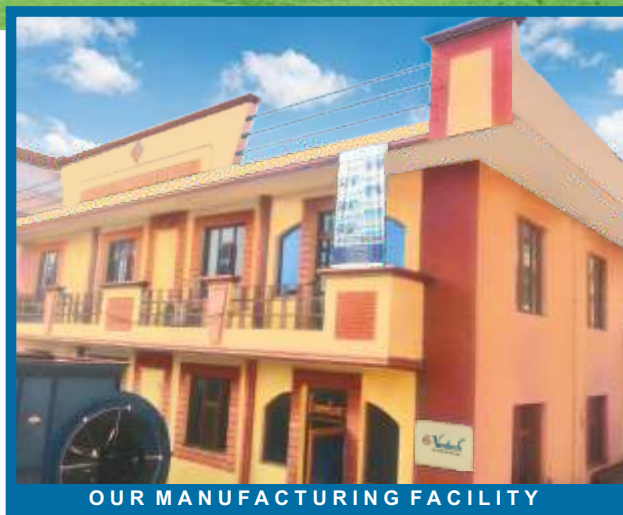
OUR MANUFACTURING FACILITY